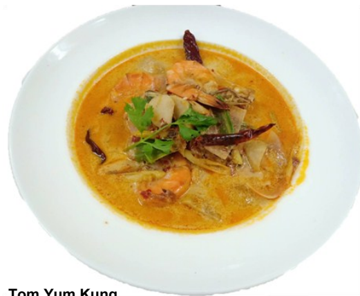
Tom Yum Kung