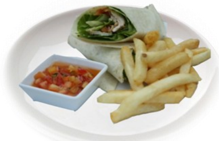
Chicken and Avocado