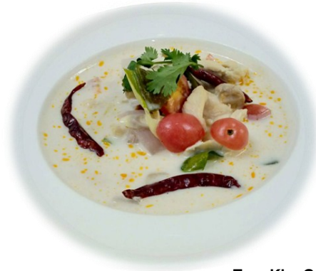
Tom Kha Gai

Thai herb infused broth with black tiger prawn, Galangal and lemongrass. Infused with roasted chili oil.