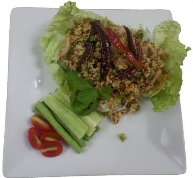
Delicious Minced Chicken Salad