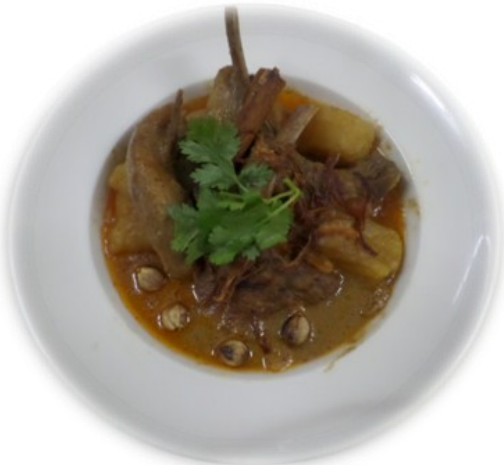
Lamb Massaman Curry

A savory thick red beef curry infused with kaffir lime leaf and chili