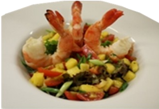
Black Tiger Prawns Salad