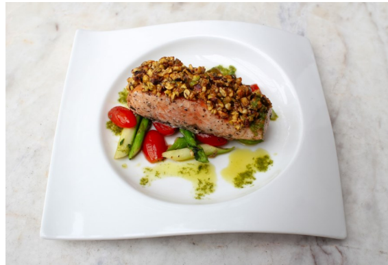
Baked salmon Pistachio crusted, asparagus, cherry tomatoes, lemon basil sauce