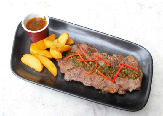
Australian Sirloin steak potato wedges, smoky chimichurri sauce