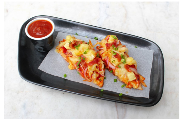
BBQ chicken breast bacon, pineapple, mozzarella cheese